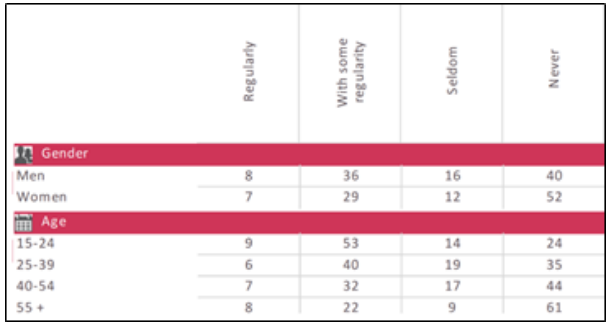
Figure 4: Eurobarometer – How often Europeans exercise

The fitness and physical activity sector has experienced constant growth in terms of revenue and membership in recent years. However, the current level of engagement among older people is far below the potential of the profile of people using the fitness sector. In detail, the visits of people to fitness centres over 65-year-old account for only 9% of total users.